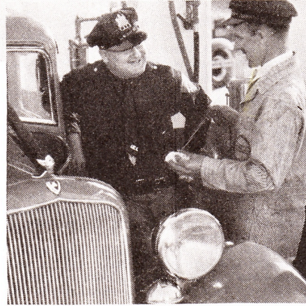
"Most cars 'eat' oil at that speed—but my gauge always reads 'full!'"

"I couldn't Stand My Old car after Driving a Plymouth on Duty"