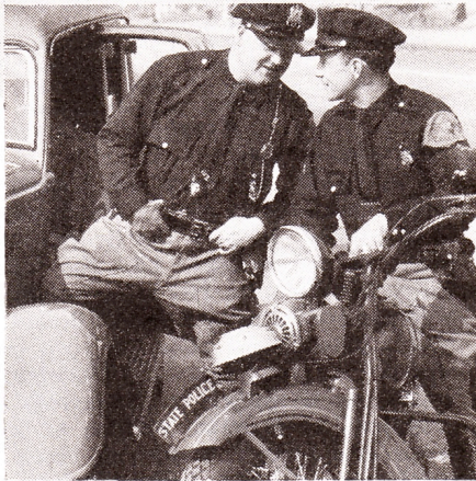
"One of the boys clocked me. She's good for 60 in second—85 in high!"